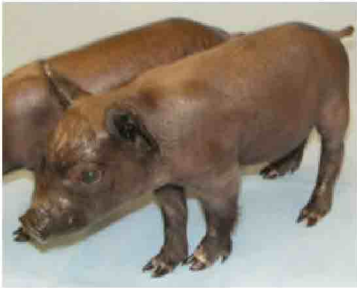
Image 1. Yucatan https://nsrrc.missouri.edu/wp-content/uploads/2018/03/tie2catalase_pigs.jpg