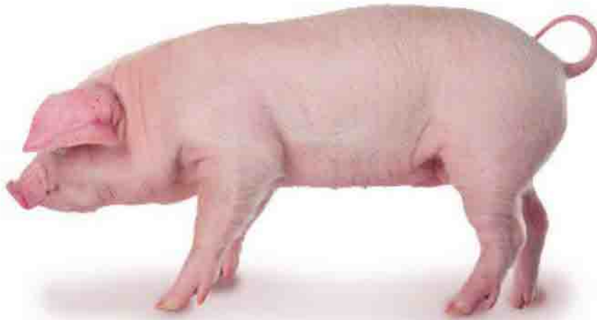
Image 3. Domestic Pig