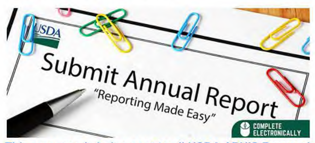
This message is being sent to all USDA APHIS Research Facilities in Active status for Fiscal Year 2022

Subject: [EXTERNAL] Fiscal Year Annual Report eAuth Reminder