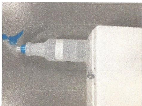
Chemical – No Expiration date