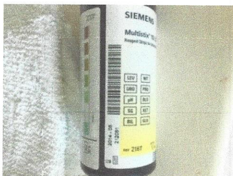
Chemical – Expired Date