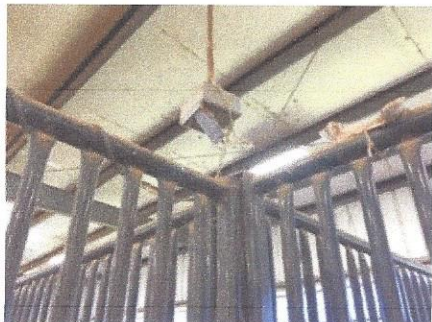
Expired wiring & plug