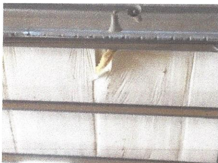
Insulation falling in Equine Barn