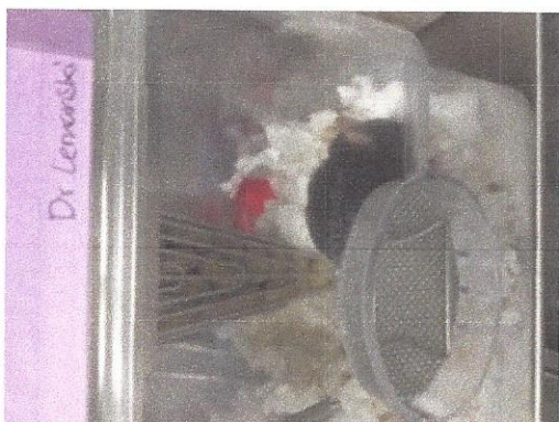
Single housed mouse