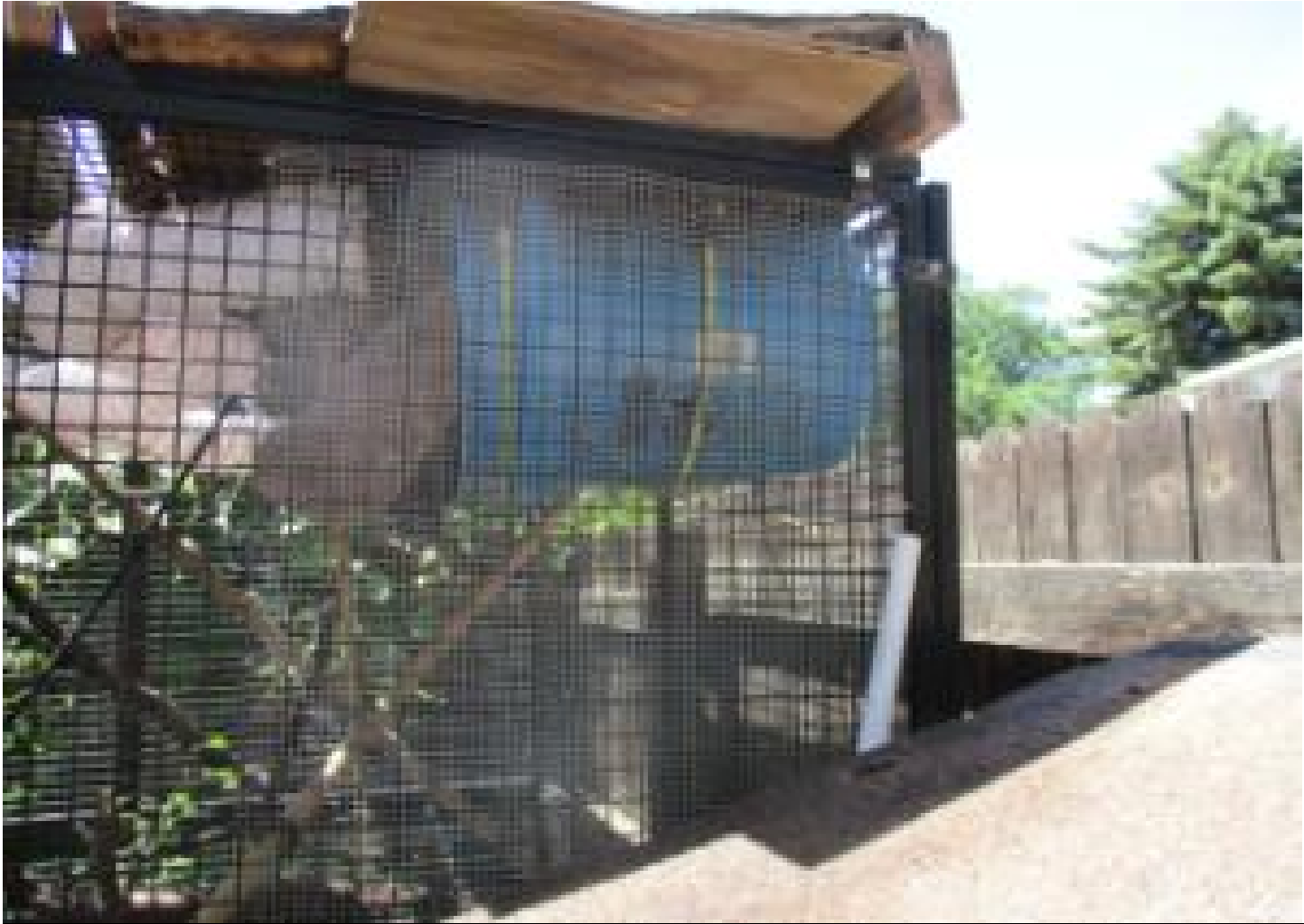
CFR : 3.78(d)